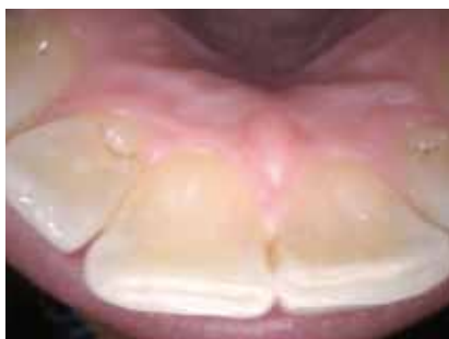
Capture a full range of intraoral views