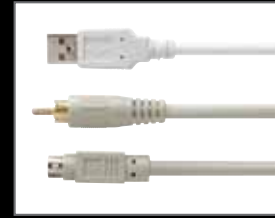
Supports USB, AV or S-Video