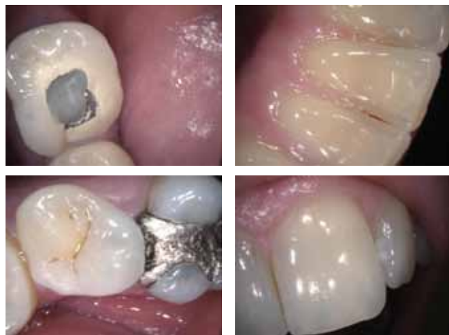
High quality images reveal even the smallest details.

The CS 1200 delivers superior image resolution (1024 x 768), providing a clear, detailed view of patients' teeth, anatomical structures, and soft tissues. And, as an affordable entry point into digital imaging, the CS 1200 puts high-quality intraoral images within the reach of any practice.