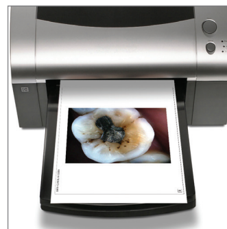
Print the image on any kind of printer.