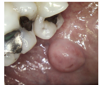
Distended saliva duct.