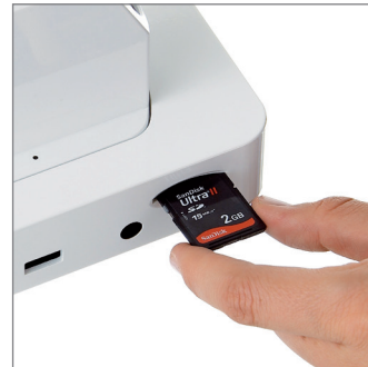
Save the image to your computer or SD card.